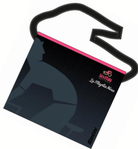
MUSETTE ER 628 -- BLACK