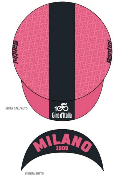
COTTON CAP RE 460 COT MILAN

High profile socks made in Coolmax fabric that offers incredible moisture management. Lightweight and breathable. Seamless construction.