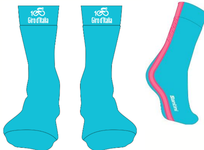
COOLMAX SOCKS RE 652 MAX SARDI

Comfortable and light with an innovative construction that maximize the aerodynamic performance .