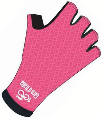
SUMMER GLOVES RE367CL+MILAN

Comfortable and light with an innovative construction that maximize the aerodynamic performance.