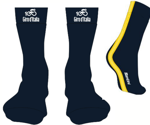
COOLMAX SOCKS RE 652 MAX BARTA

Comfortable and light with an innovative construction that maximize the aerodynamic performance.