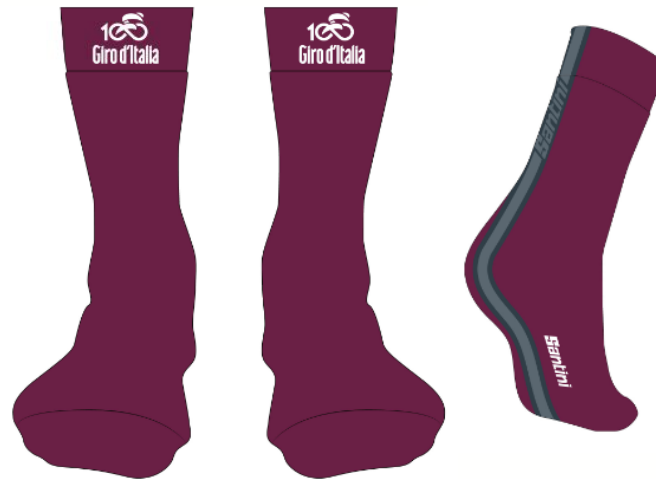
COOLMAX SOCKS RE 652 MAX COPPI

Comfortable and light with an innovative construction that maximize the aerodynamic performance.