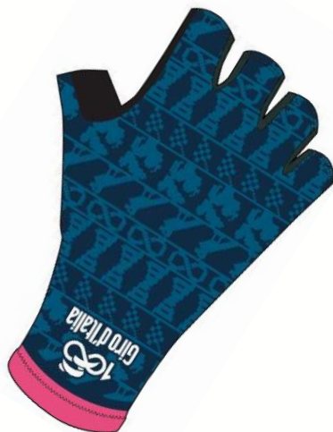
SUMMER GLOVES RE367CL+SARDI

Comfortable and light with an innovative construction that maximize the aerodynamic performance .