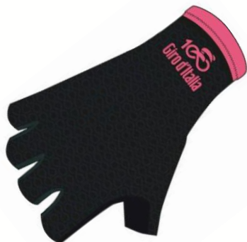
SUMMER GLOVES RE367CL+BLACK