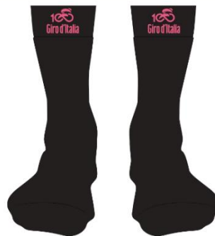
COOLMAX SOCKS RE 652 MAX BLACK