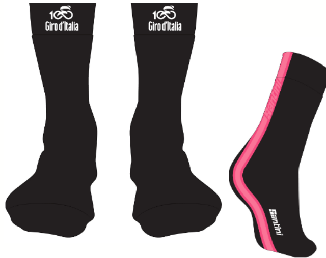
COOLMAX SOCKS RE 652 MAX MILAN

Comfortable and light with an innovative construction that maximize the aerodynamic performance.