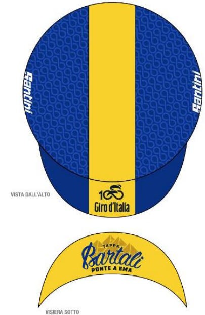
COTTON CAP RE 460 COT BARTA

High profile socks made in Coolmax fabric that offers incredible moisture management. Lightweight and breathable. Seamless construction.