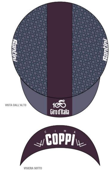
COTTON CAP RE 460 COT COPPI

High profile socks made in Coolmax fabric that offers incredible moisture management. Lightweight and breathable. Seamless construction.