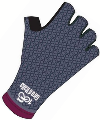
SUMMER GLOVES RE367CL+COPPI

Comfortable and light with an innovative construction that maximize the aerodynamic performance.