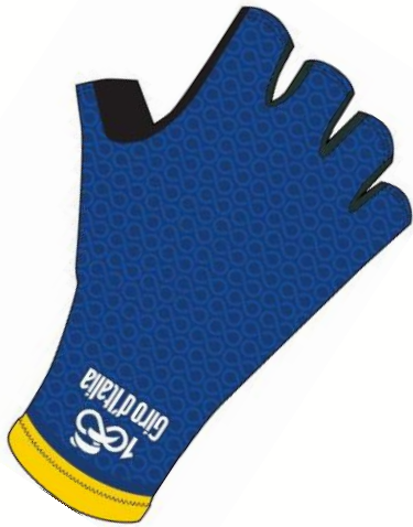
SUMMER GLOVES RE367CL+BARTA

Comfortable and light with an innovative construction that maximize the aerodynamic performance.