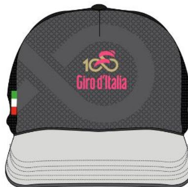
TRUCKER CAP RE 464 TRU BLACK